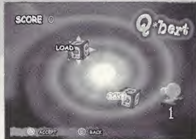
Save / Load Screen

* Press the A Button to load the previously saved game from the desired Save Cube.